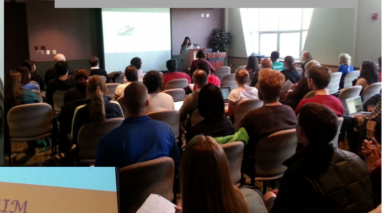
Arzoo Osanloo, "Forgiveness in Iranian Criminal Sanctioning"