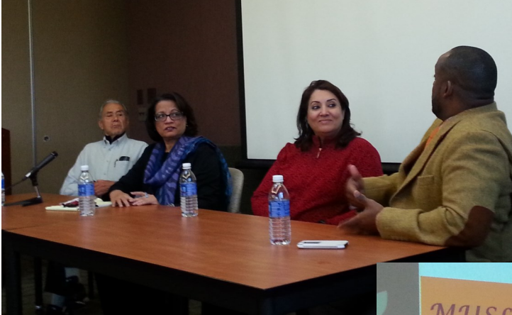
MSP Faculty Panel