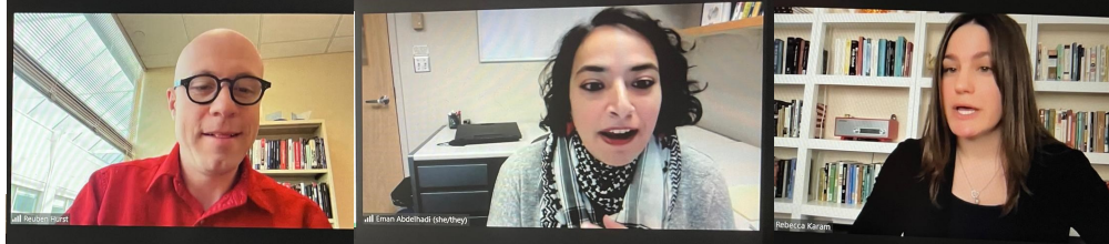
17th annual conference ("Researching Muslim America")