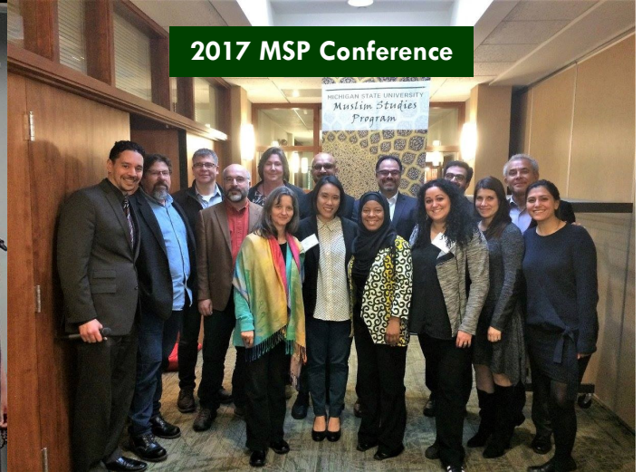
2017 MSP Conference