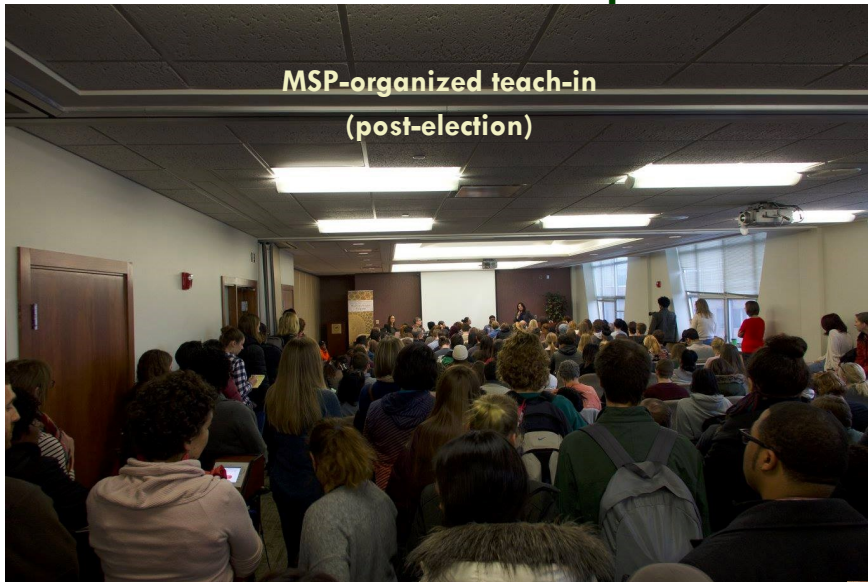
MSP-organized teach-in (post-election)