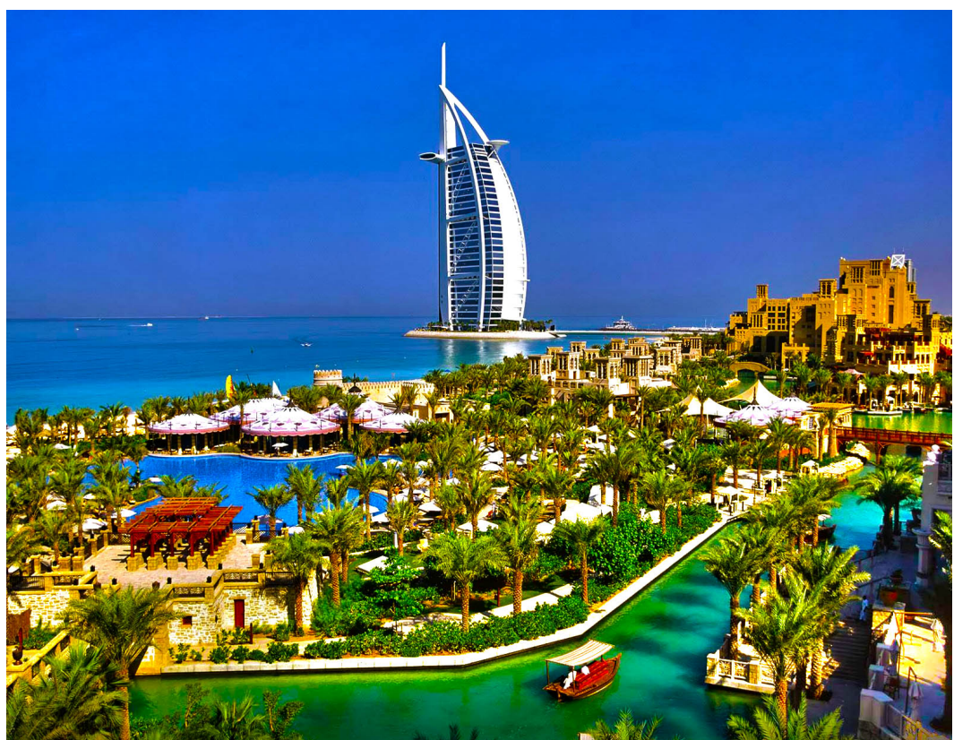
Discover Dubai and Experience the United Arab Emirates

This program explores the cultural, social, and political effects of contemporary globalization on a city that seems to represent the divergent outcomes of today's capitalism. Dubai has rapidly modernized in recent decades along with the rest of the country of the United Arab Emirates. But, the Emirati community has had to struggle to reconcile the rapid economic development with norms, traditions, and attitudes. The city has also attracted incredible wealth, but also significant population of migrants that has made Emiratis a minority in their own country. These contradictory economic, and social conditions offer the opportunity to discuss the importance of changing contexts to cultural communities. This tension is highlighted by the observation of the remembrance of traditions of the past in the midst of great plans for building a social and physical landscape for the future