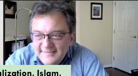
Panel on "Globalization, Islam, and Marketing"