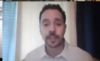
Panel on "Afghanistan in this Critical Moment"